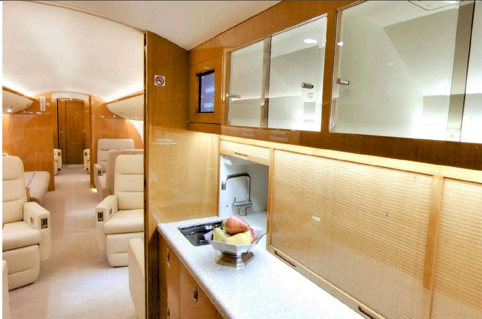
GALLEY AND INTERIOR FWD